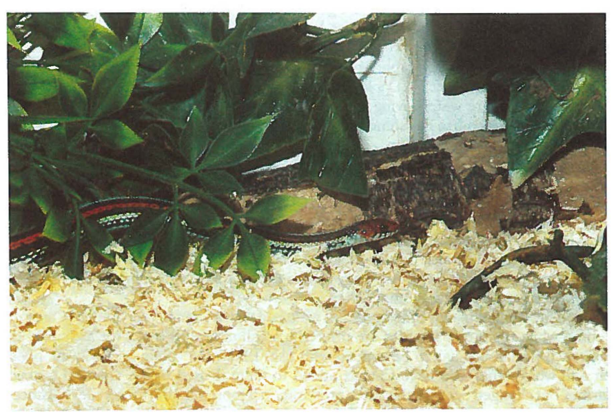
Foto 3: Thamnophis sirtalis tetrataenia. Vrouw, nakweek. Female, captive-bred.

My animals have always been housed in a terrarium of 265x185x60 cm (lxwxh) overall, made of plasticised chipboard (sold in the UK as Contiboard or Contiplas - a formica-coated chipboard). The terrarium was once divided into several compartments varying in length 90 to 110 cm long and 40 to 50 cm high but since early 1995 I have adapted this and now the separate cages are between 70 and 110 cm long and about 30 cm high and 60 cm wide. After the reconstruction the terraria had to be moved to a smaller room, therefore I was forced to make the terraria lower in height to be able to provide the animals with as much floor space as possible. A lower height is not too bad at all, for over the years it had become clear that Garter snakes are no real climbers.