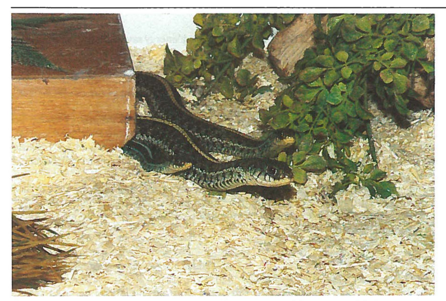
Foto 1: Thamnophis sirtalis similis. Links een man, midden en rechts vrouwen. Man on the left, females in the middle and on the right.