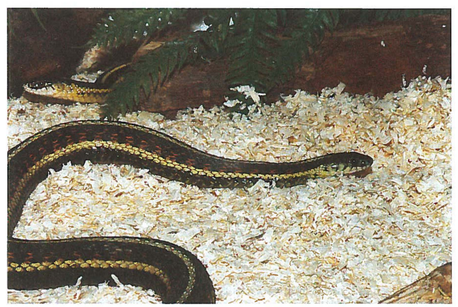
Foto 2: Thamnophis sirtalis parientalis. Twee vrouwen. Two females.